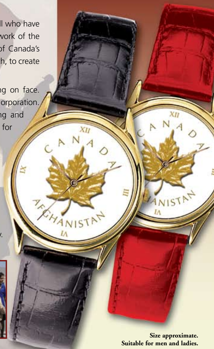
Size approximate. Suitable for men and ladies.